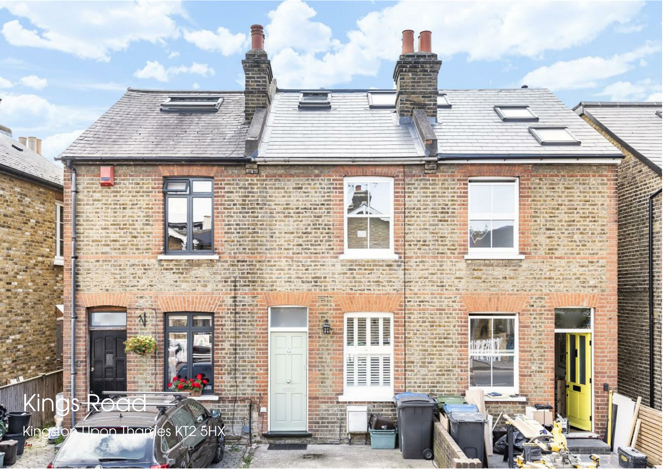
Kings Road Kingston Upon Thames KT2 5HX